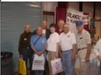
To the left are the area HAMS who went to the Orlando Hamfest. Recognize a few of them?