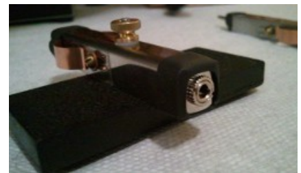
Rear view. This unit was made with a 3.5mm jack, and would include an audio patch cable to connect to the rig.