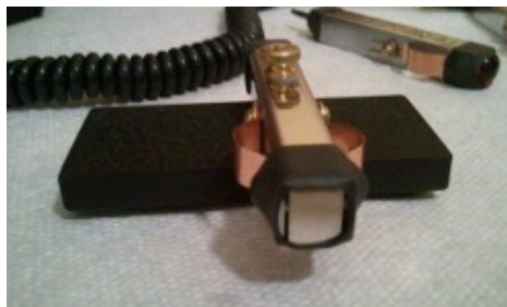
Front view of a new Te-Ne-Ke.

An early Te-Ne-Ke, built by NE8KE himself. This unit has the old aluminum head with a jewel on the front, and has a 3.5mm plug on the back. An audio extension cable is used to connect it to the rig.